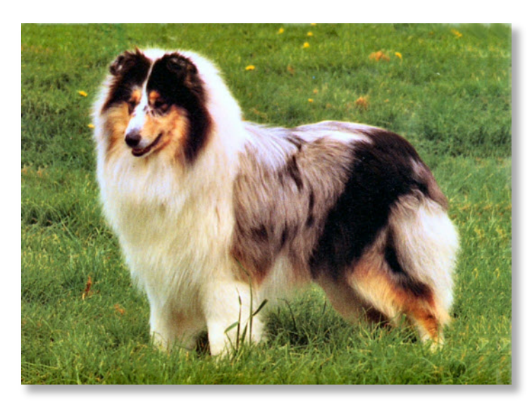
fig 3: Blue merle White-factor Male Champion who gained his title in 1992

More recently this white patched blue merle dog (fig 3) was both campaigned to his title at a time when Rough Collie Championship Show entries would average in excess of 200 Rough Collie exhibits present at each Championship Show throughout the year, and again he was so widely used at stud that his breeding infiltrates almost all British Blue Merle lines of today. Finally only this year a white patched bitch (fig 4 below) after a